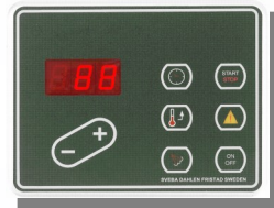
User-friendly instrument panel angled towards the oven